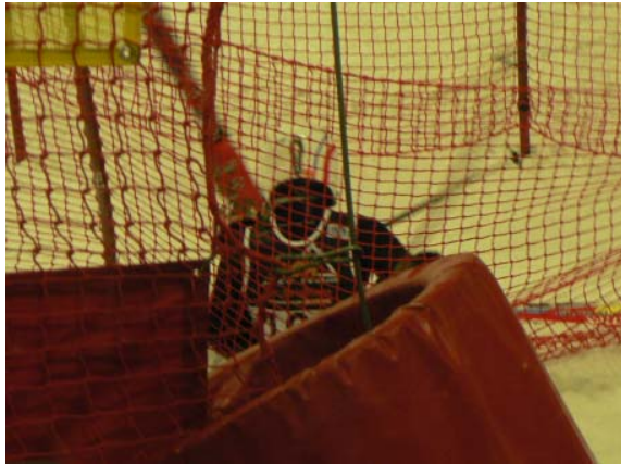
A few people took the netting out. You know who you are!