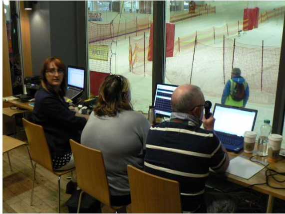
THE Commentary Team