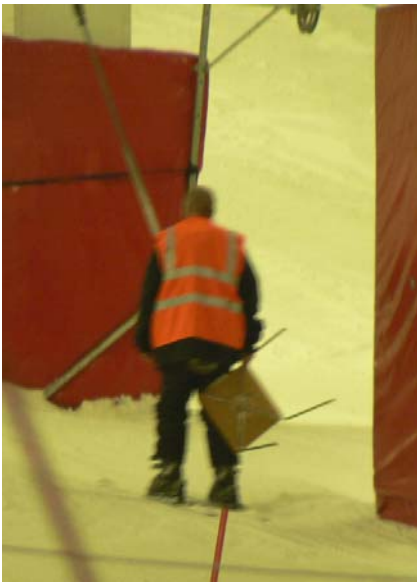
Going for a sit down?

The picture of you changing in to your salopettes had to be censored