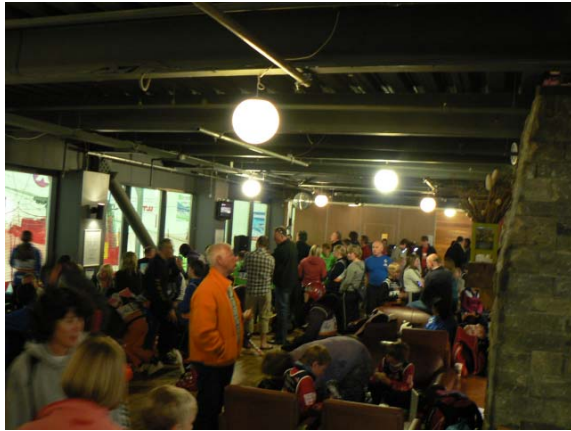
Noise and mayhem!